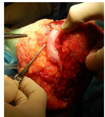
FIG. 3: OVERALL SECUREMENT