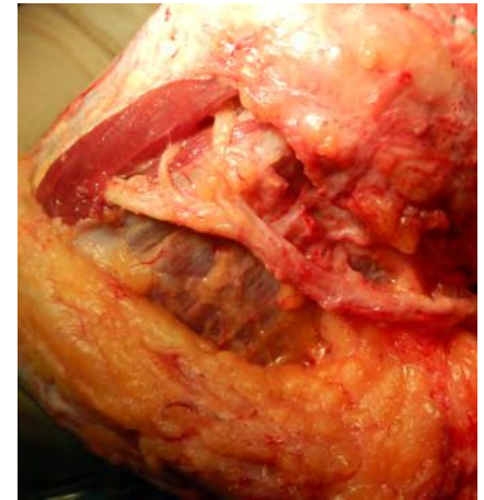
FIG. 1: TRANSPOSITION

Intraoperatively, the patient regained full motion. Three months after application of the CLARIX ® CORD 1K matrix, the patient regained full extension and improved flexion compared to preoperative evaluation. In addition, the patient had return of full sensation, cessation of pain and improved strength in the ulnar nerve distribution.